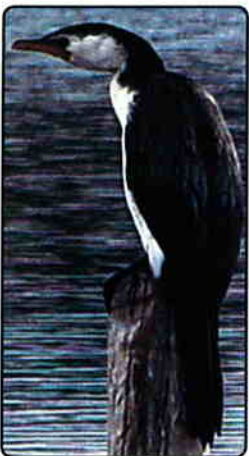
Little Pied Cormorant